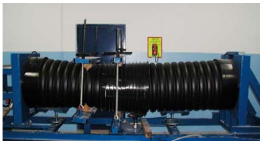
Leak tightness test

The Standard was published by CEN in April this year and this will be followed in the UK, for example, by BS EN 13476 and in France by Afnor EN 13476.